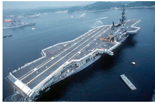
This picture needs no caption. We all know who she is.

It was much later that I learned that this well-wisher's expression meant "(wishing you) a prosperous journey." Midway had travelled well over five thousand miles by the time we rendezvoused with Old Blue Eyes, but never did we prosper more than that Independence Day.