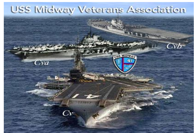
The three configurations of the USS Midway