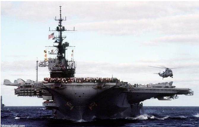
USS Midway heading into port with her crew standing proud and lining the flight deck. A Midway chopper leads the way.