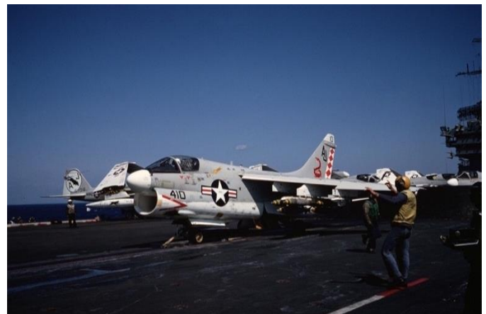
A-7 Corsair on the Catapult, ready for Launch

Later, in the dark of the night, I went topside to see if I could find the canopy-less jet. I didn't, but I distinctly remember, walking just forward of the island and detecting something moving in front of me. An E-2 engine was running and the propeller was turning at a high speed. There were no safety observers to be found. Had I walked just a couple more feet, I probably would've become a statistic! But here I am, all these years later, still "sailing on."