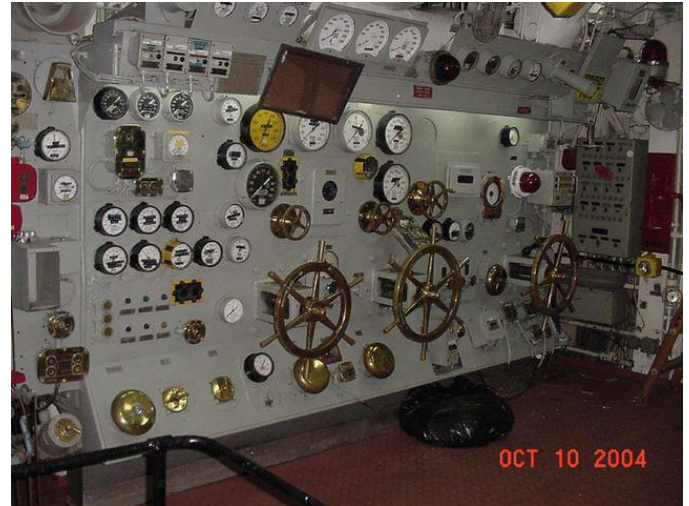
Midway Engine Room

We attempted to isolate the fireroom to continue steam service to 1 Baker fireroom to allow for recovery operations. A few minutes later we shut down fires when feedwater pressure was too low and cooling water was lost to auxiliary machinery in the fireroom.