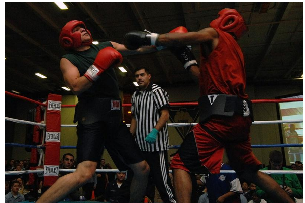
Smokers in the Hangar Bay (USS Carl Vinson CVN-70)

Years later (77-80) I was stationed in Subic Bay. I was married by then and had a daughter and a son on the way, so I couldn't wander around Olongapo at night. I found out that the base held smokers at the football field. My wife and I enjoyed watching the matches. I brought a six pack of beer and usually when that was gone it was time to go home.